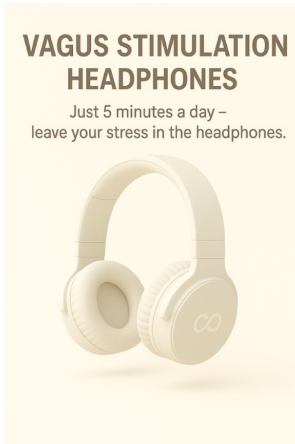
Figure 9.1: The best headphones for VNS